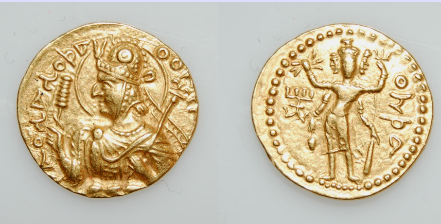
Siva with thunderbolt