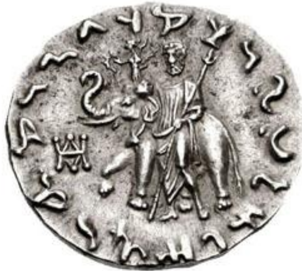
Zeus - Indra