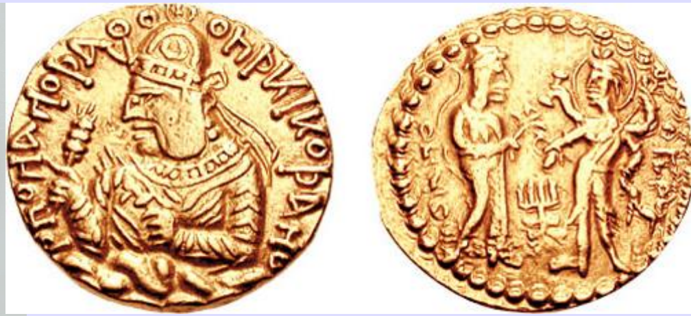
Siva and Uma