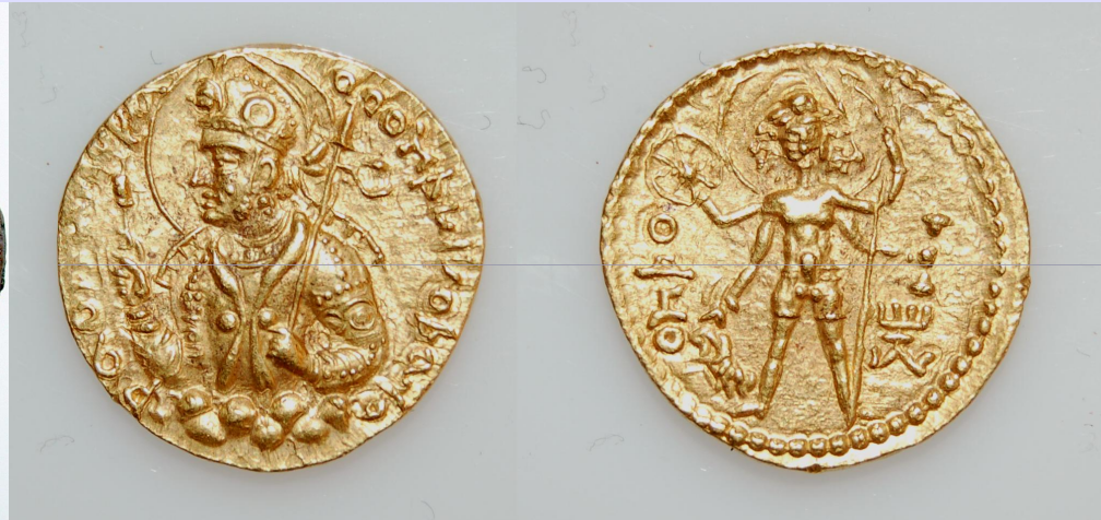
Lakulisa with Chakra