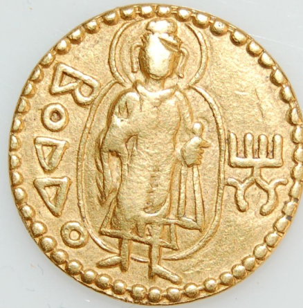
Gold coin from Ahin-Posh Stupa