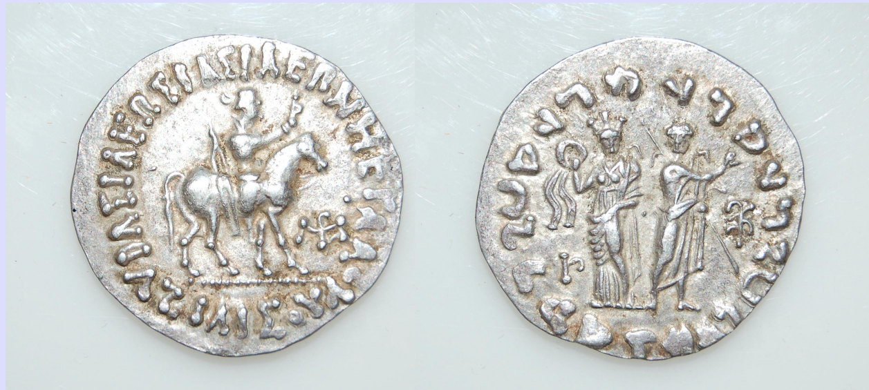
Tyche and Zeus